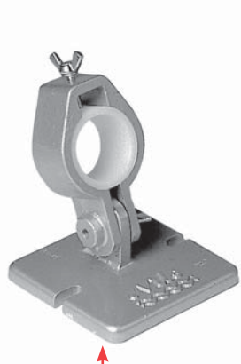
Type A Mounting Bracket for MR-3 and MR-10 (dia. range = 1 13 / 16 " ~ 1 23 / 32 " )