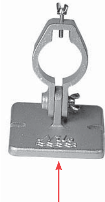
Type B Mounting Bracket for MR-30A , MP25AM , MP20M (dia. range = 2 7 / 32 " ~ 1 29 / 32 " )