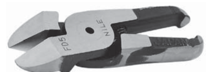
Part No. FD5