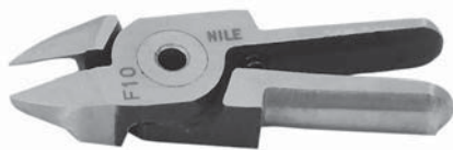
Part No. F10