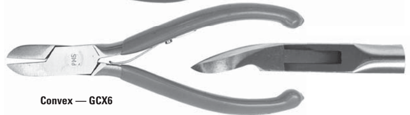
Convex — GCX6