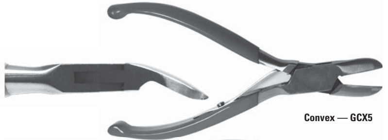
Convex — GCX5